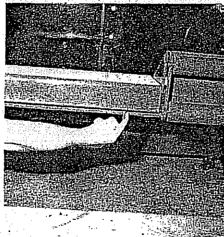
RAISE OR LOWER SPILL PLATE

Spill Plate. The spill plate may be raised or lowered by releasing the two spring lock bolts on each side of the plate. This is done to prevent the truck hitch from damaging the spill plate when hooking up to the paver and dumping mix into the hopper.