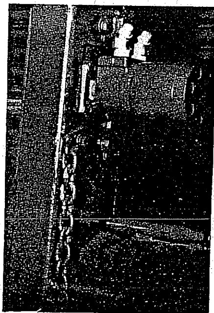
ADJUST CHAIN TENSION

When the proper tension is obtained, retighten the adjust screw jam nut and retighten the motor mount plate anchors.